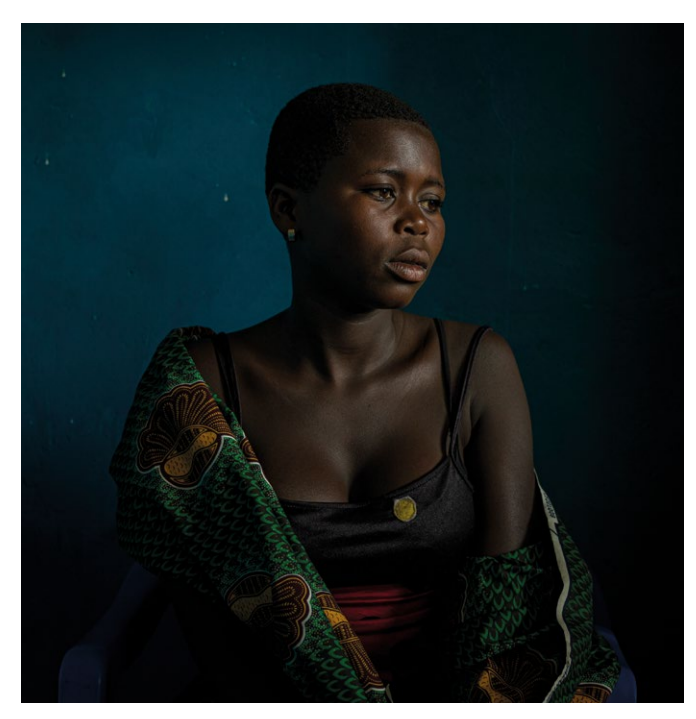
This woman from the Democratic Republic of Congo, aged only 16, is a survivor of sexual assault.

These combined actions slowly give communities space to openly talk about mental health issues and the importance of accessing mental health services. In the end, it is essential to have a service that effectively provides care for people which will make the difference for them."